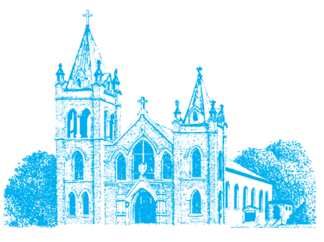
St. Gabriel Archangel